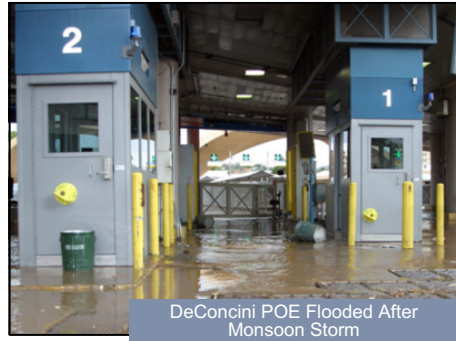
DeConcini POE Flooded After Monsoon Storm