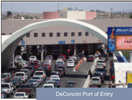
DeConcini Port of Entry

The ports in Nogales serve as a hub for implementing innovative solutions that facilitate cross-border commerce, including Unified Cargo Processing , refrigerated docks for produce , and a $134 million investment for the modernization of SR189 . Along with these projects, the DeConcini port of entry needs modernization. Long lines and aging infrastructure have worsened wait times, and the work environment is unsuitable for officers. The Nogales community is advocating for the DeConcini POE to be elevated in Custom and Border Protection's priority list of port of entry projects. For additional information, please visit the Greater Nogales Santa Cruz County Port Authority's website at: www.nogalesport.org .